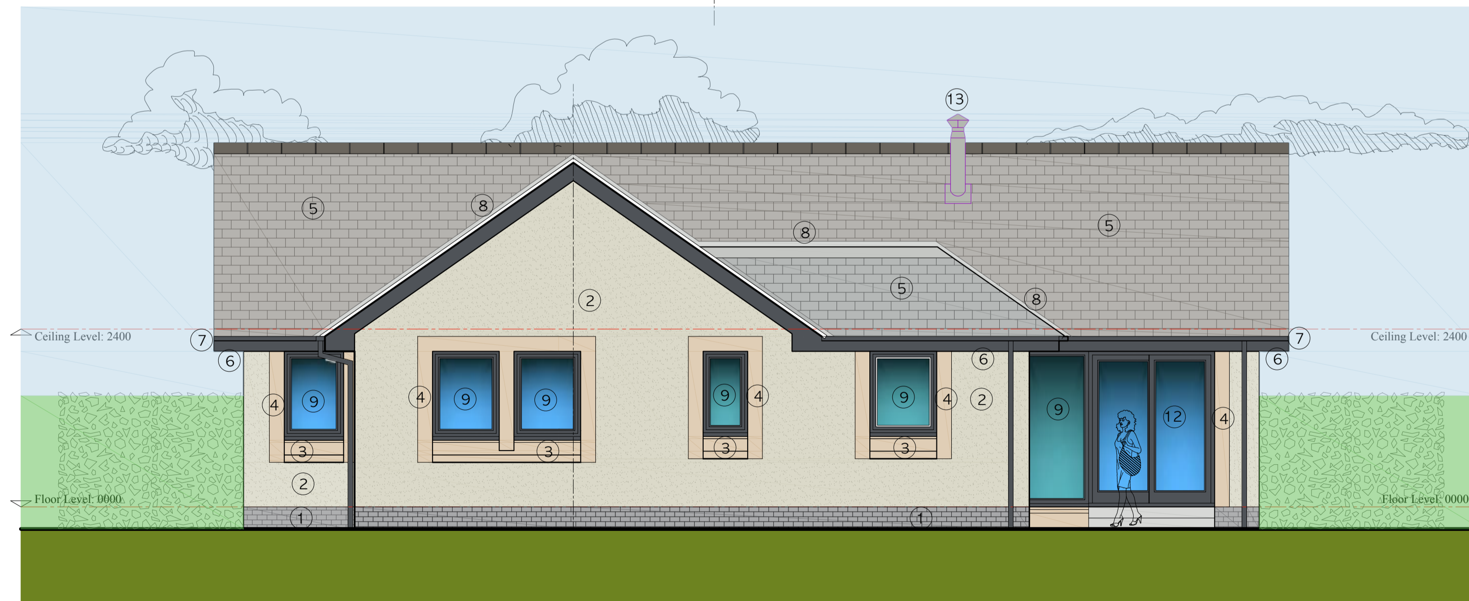
SOUTH Elevation REAR Scale : 1 : 50.