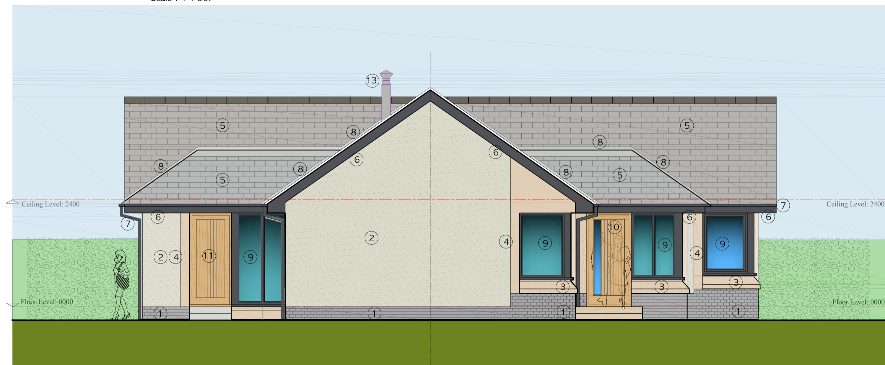
EAST Elevation SIDE Scale : 1 : 50.